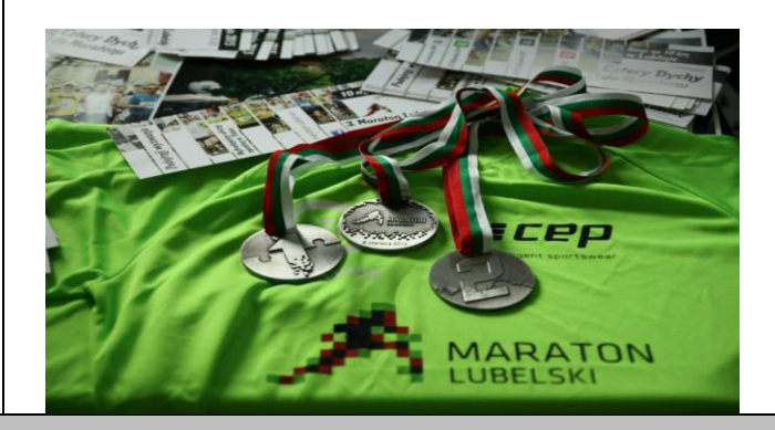
commemorative medal at the finish line