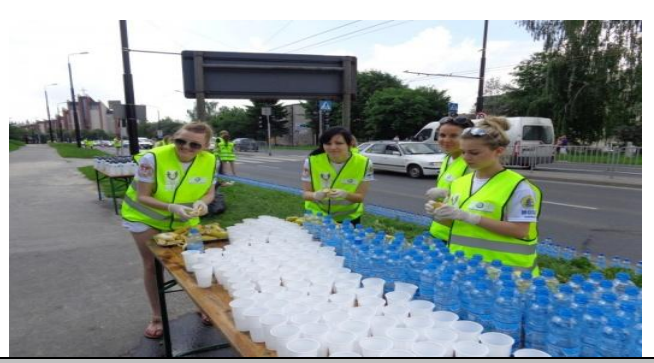
Water and sports drinks along the route and at the finish of the run